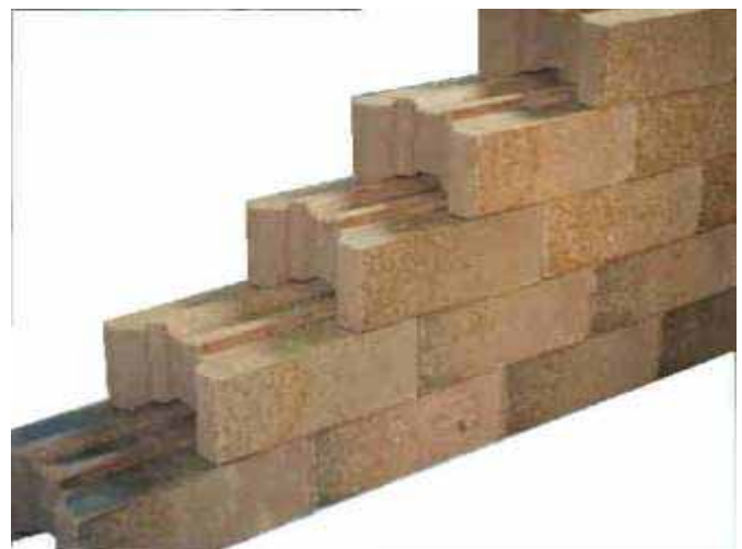
An interlocking Clay Block

Made of "Insitu" soil plus RoadPacker Clay Brick Stabiliser (C.B.S.) and compressed at over 6000 lbs PSI, the block size is consistently +/- 200 mm (length) x 200 mm (width) x 100mm (height) weight +/- 12kg and the MPA is > 8 mpa