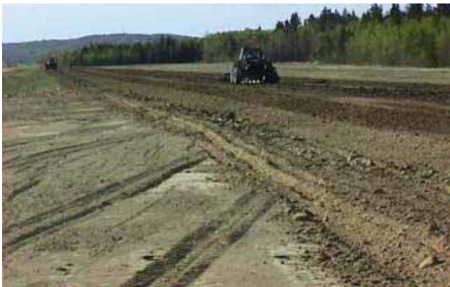
This is a new airstrip in Big River Saskatchewan Canada being prepared for treatment with RoadPacker Plus, May 1998.

Governments world-wide have instructed their bureau of standards to conduct research into new testing procedures that would provide provincial and private road construction engineers and consultants, with an effective means of assessing, in advance, the extent to which chemical stabilisation will improve the mechanical properties of their materials. These new testing procedures have been identified and published. Undoubtedly, a major swing toward the use of chemical stabilisation, will create the huge benefits inherent in using in-situ soils that would otherwise be unsuitable and require transporting away to waste.)