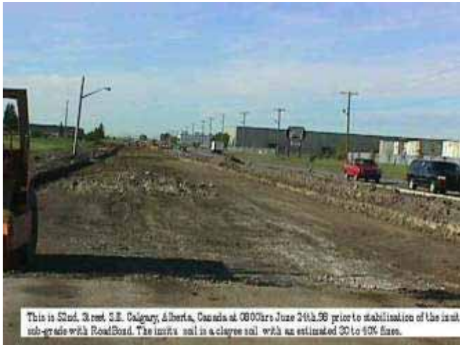
This is 52nd. St. east S.E. Calgary, Alberta, Canada at 0800hrs June 24th.98 prior to stabilisation of the insitu sub-grade with RoadBond. The insitu soil is a clayey soil with an estimated 30 to 40% fines.

RoadBond also binds the fine particles and increases compaction of the surface layer to prevent dust in roads, driveways, yards, construction sites and car parks. RoadBond is manufactured from a powerful natural organic binding agent. In its capacity as a compaction aid and soil stabilisation agent, it will increase soil density and bearing strength, while reducing voids plasticity.