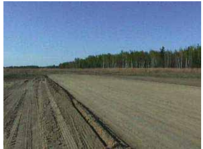
This is the same airstrip after it has been treated and packed with RoadPacker Plus™ May 1998.

Projections show that millions of dollars would be saved annually in terms of reduced maintenance costs (not only from a reconstruction point of view, but also from a reduced need for routine grading and watering of gravelled roads). Certain tests carried out over a twelve-month period have revealed that the chemically stabilised sections did not require any routine grading, whereas identical but untreated sections of the same roads, required grading at least once or twice per month