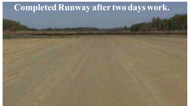
Completed Runway after two days work.

RoadPacker Plus is completely environmentally friendly in its diluted form when added to water.